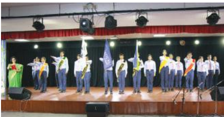
Investiture of Prefect Council