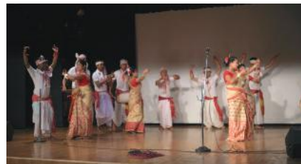
May Day Celebration